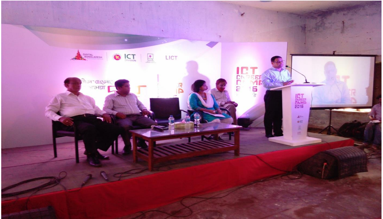
Career Camp for honours level students