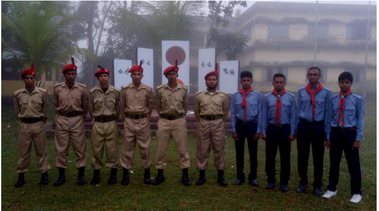
BNCC & Rover Scout