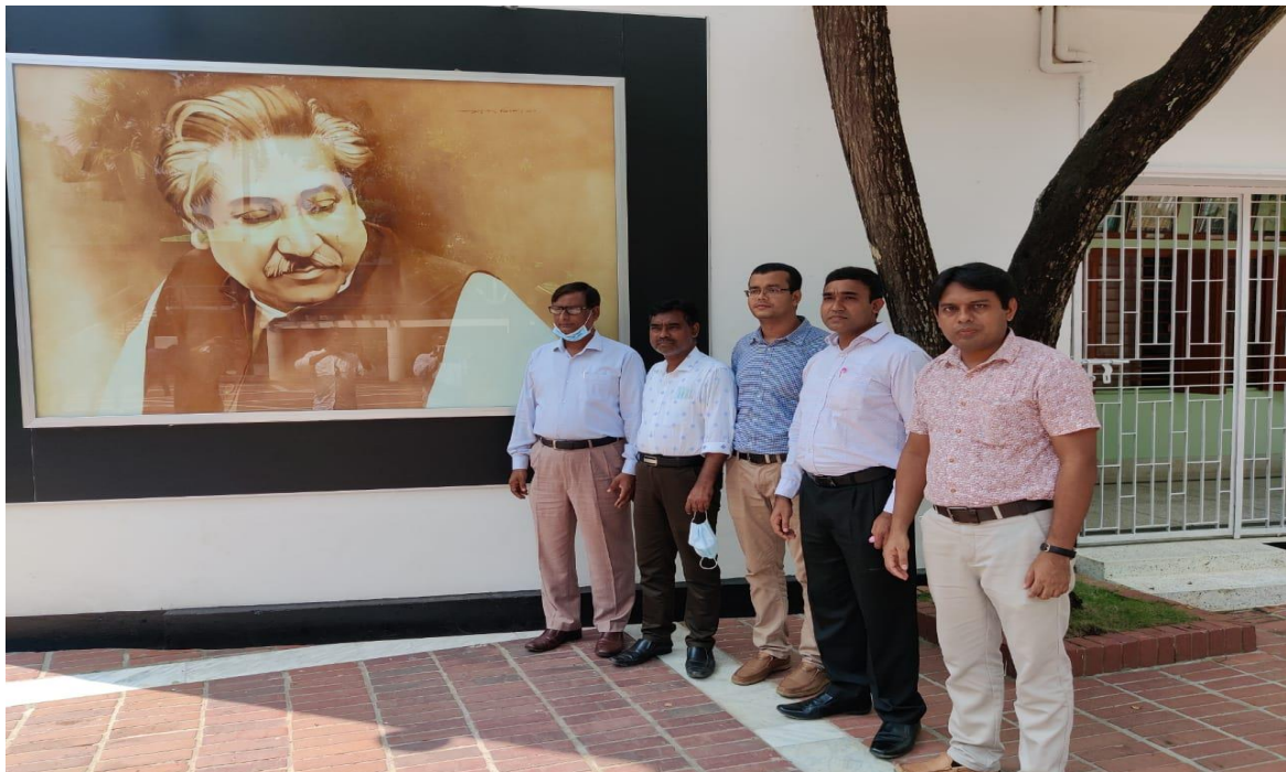
Visiting the Mousoleum of Bangobandhu by newly joined principal