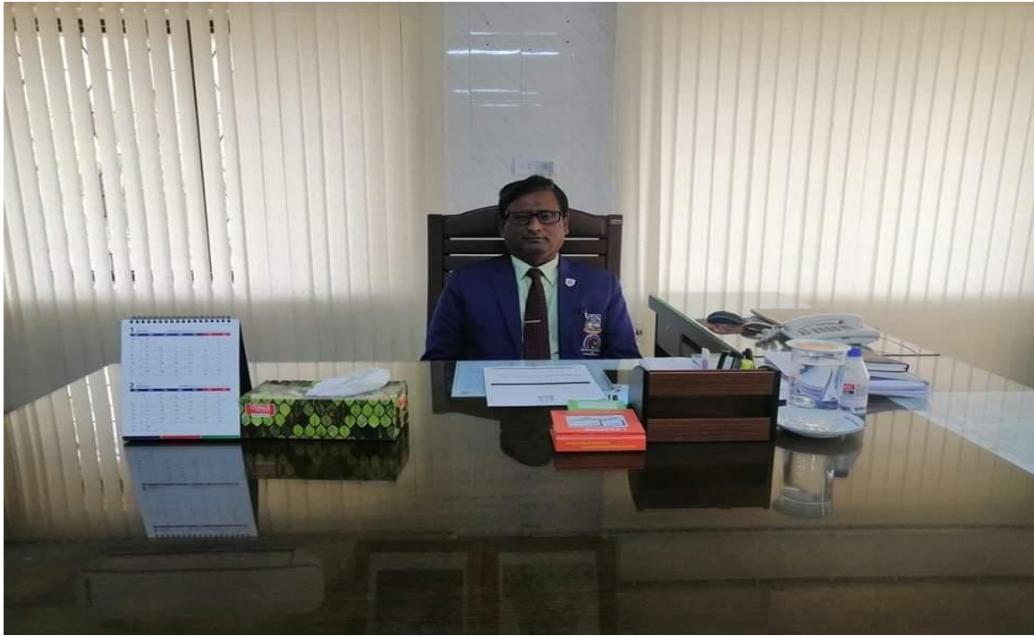
Office room of Principal