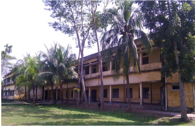
Main Academic Building

courses in Bengali, political science, history, history and culture of Islam, philosophy, accounting, English and management in addition to the faculties of arts, commerce and science in the higher secondary and degree (pass) classes. Moreover, Masters courses in Political Science and Accounting are being introduced.