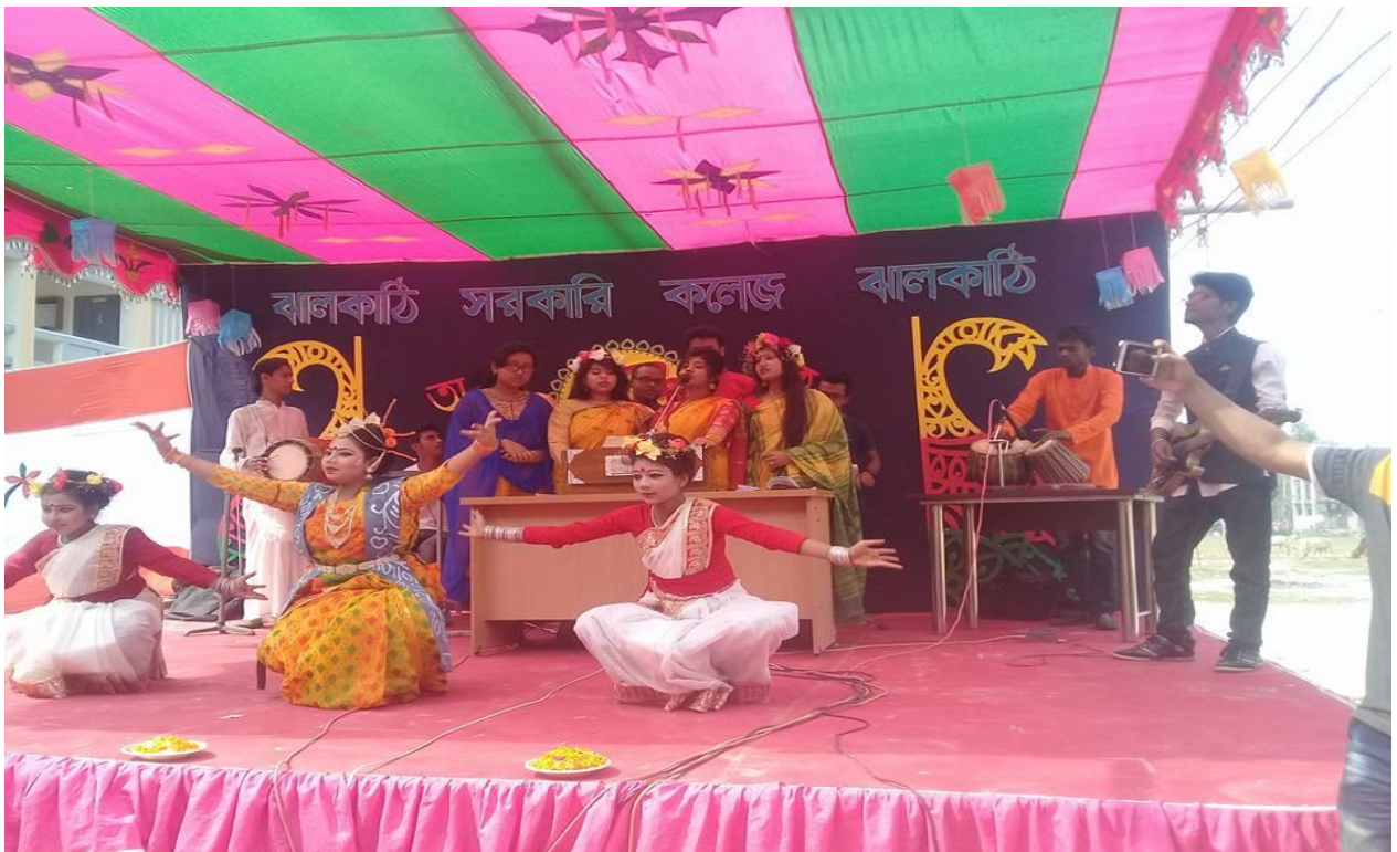
Cultural program in Jhalokathi Govt. college