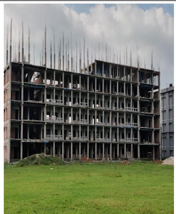
Ten Storied Building (Under Construction)