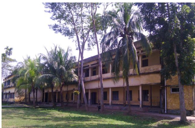
Main Academic Building

surrounding the college also came and were admitted in the college. The college offers honors courses in Bengali, political science, history, history and culture of Islam, philosophy, accounting, English and management in addition to the faculties of arts, commerce and science in the higher secondary and degree (pass) classes. Moreover, Masters courses in Political Science and Accounting are being introduced.