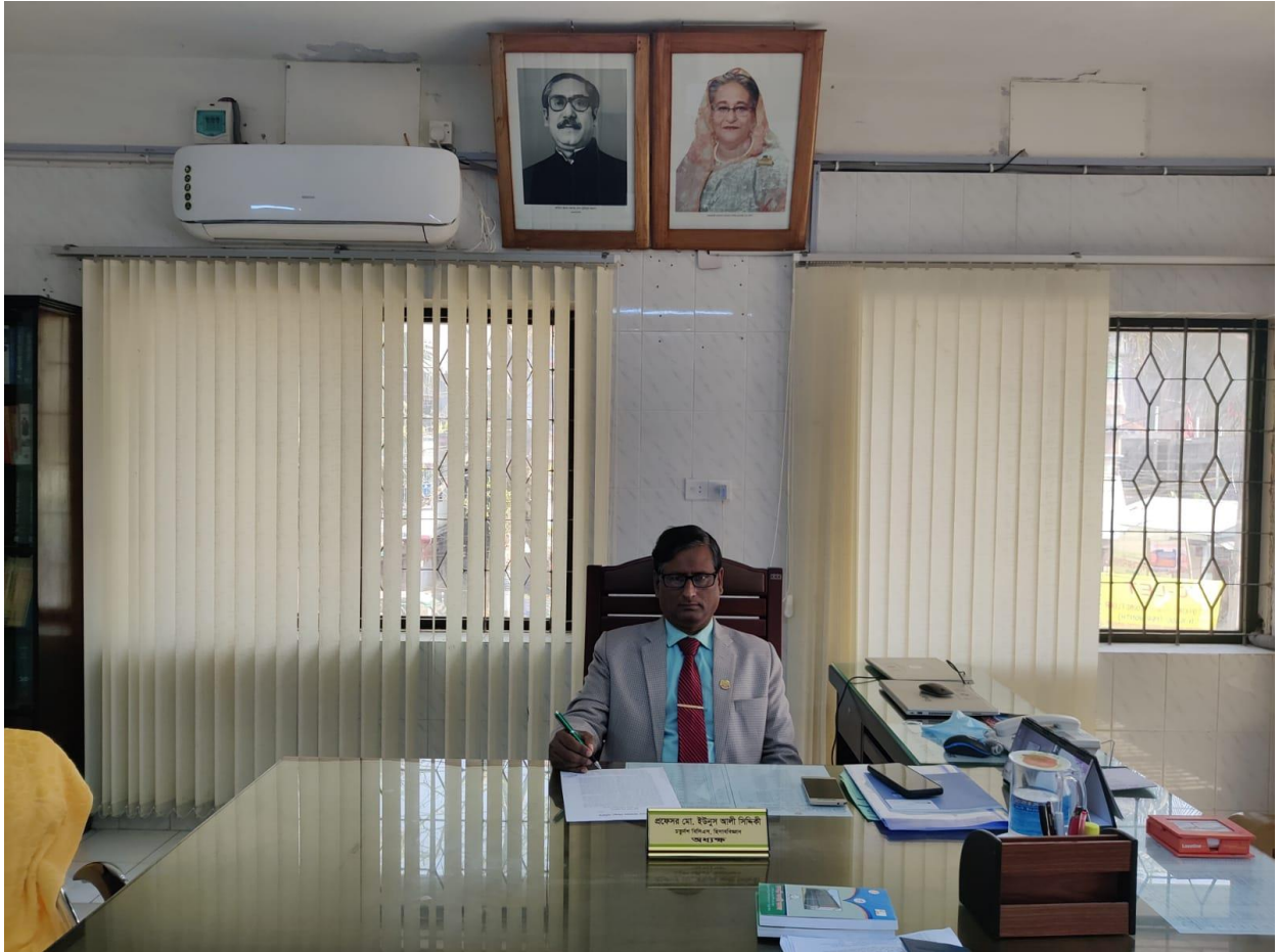
Office room of Principal