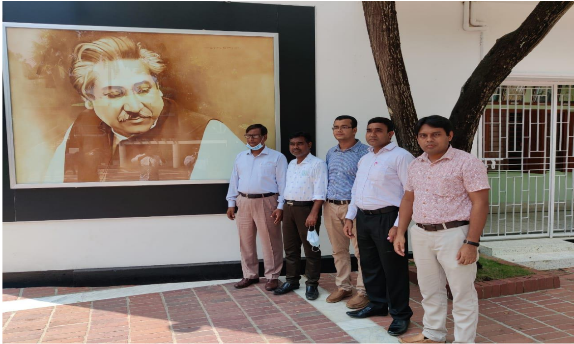
Visiting the Mousoleum of Bangobandhu by newly joined principal