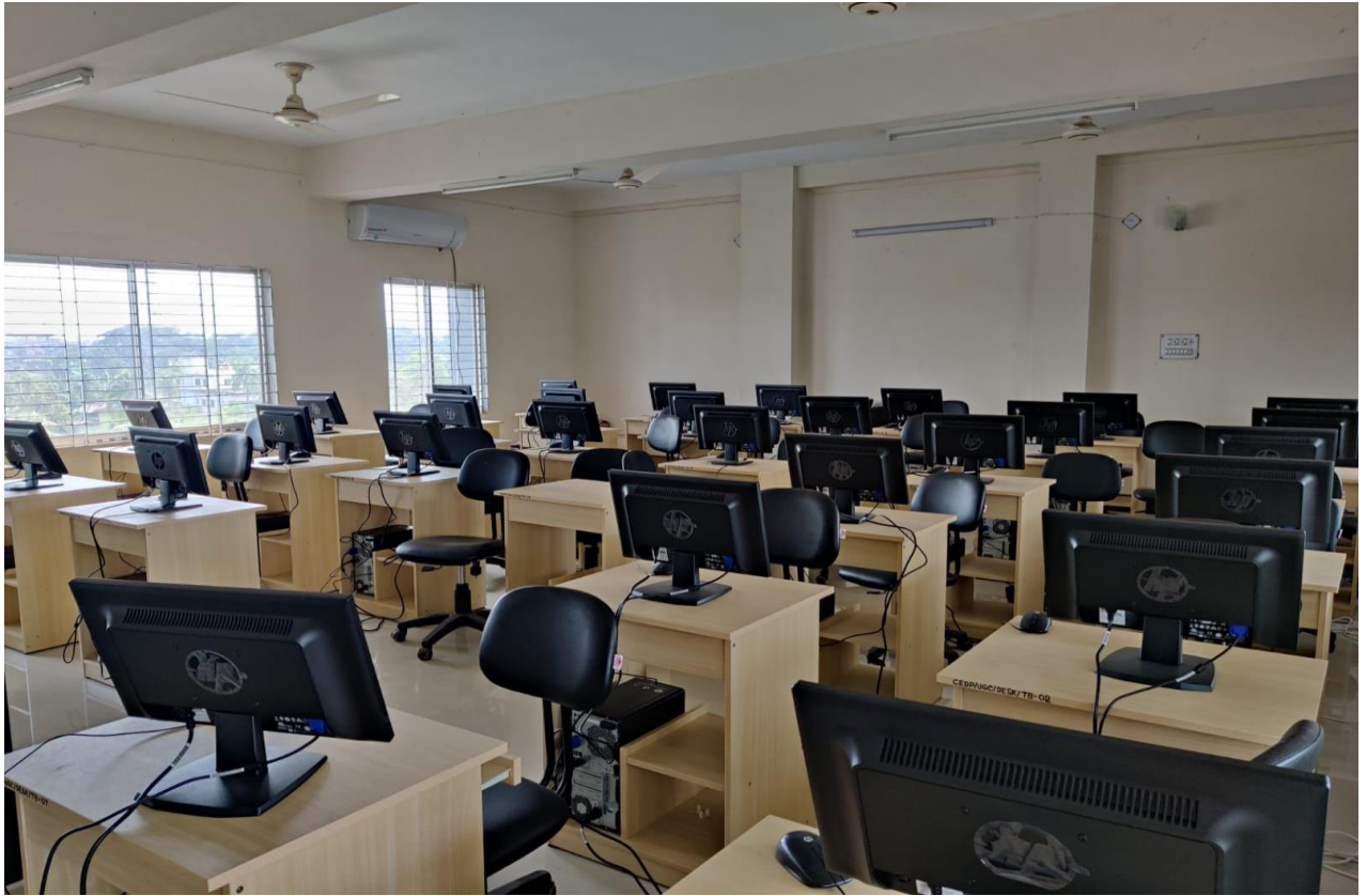
Computer Lab ( CEDP)