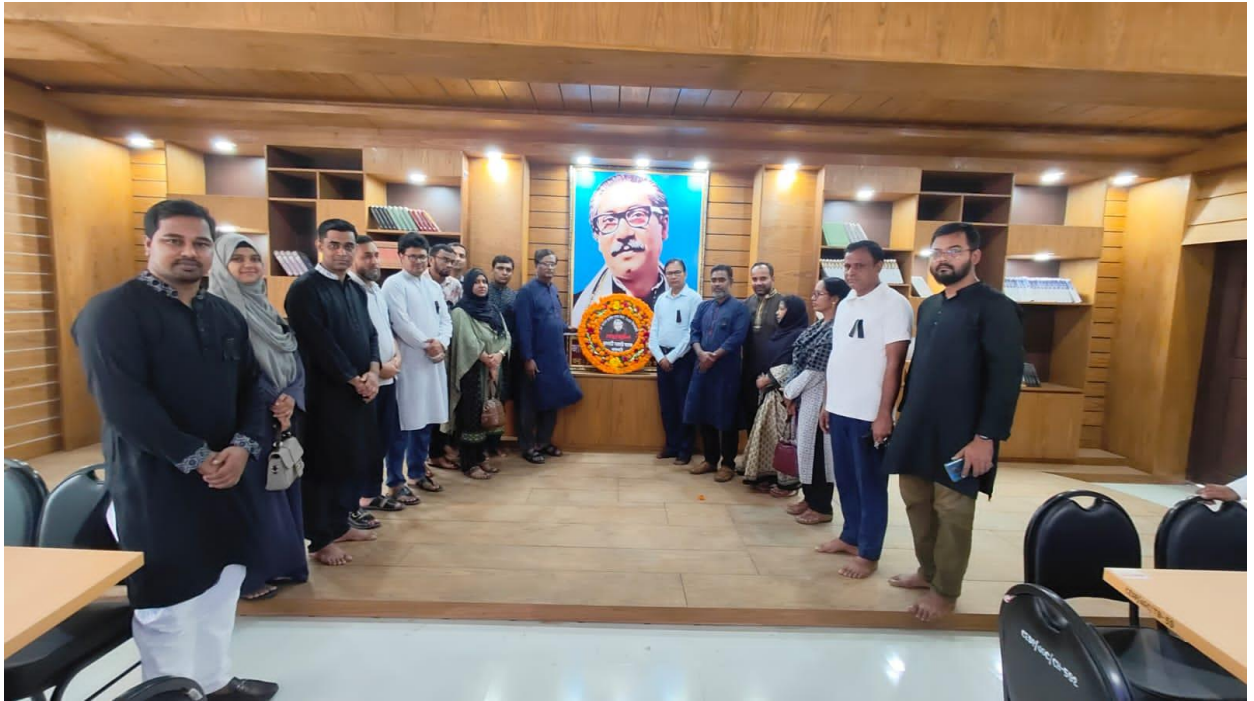
Observance of National Mourning Day -2022 at Jhalokathi Govt. college