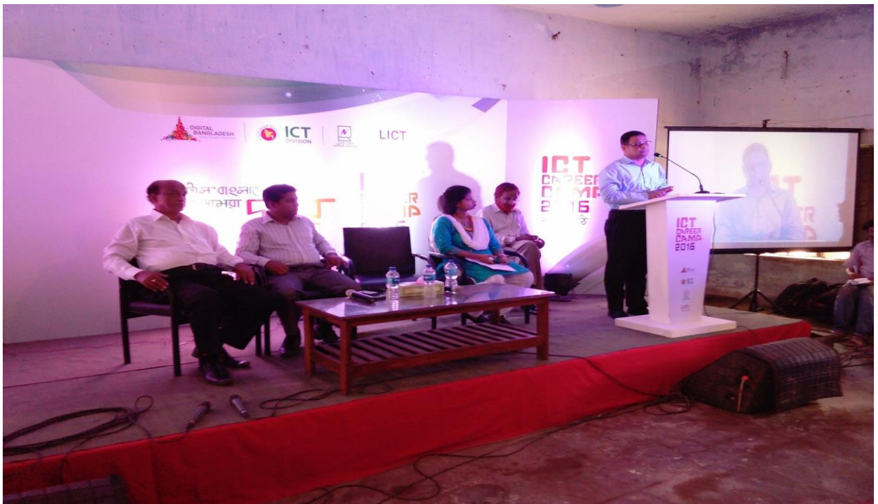
Career Camp for honours level students